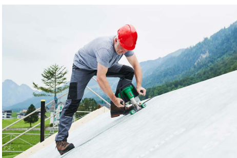
Always weld pitched roofs from bottom to top.