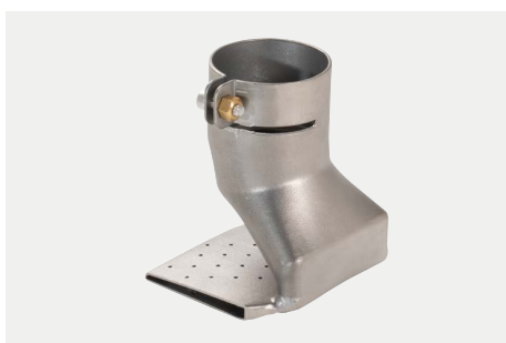
Overlap welding nozzle, left, 40 mm, Art. 178.119