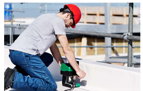
Industrial roofs and foundation waterproofing